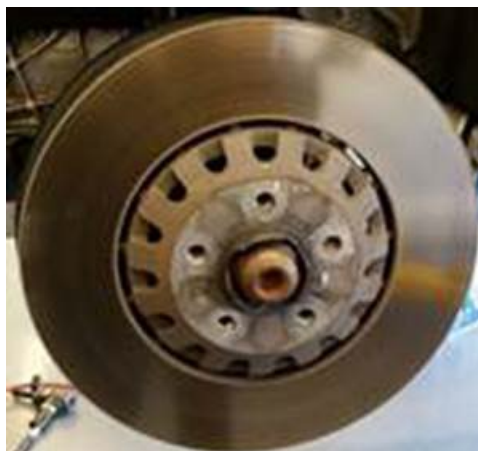
Figure 7. Example of the whole disc.