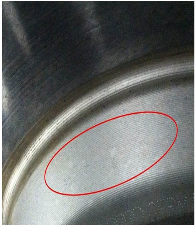
Figure 4. Small spots and discoloration due to chemical contamination from the cleaner that was sprayed directly onto the disc.