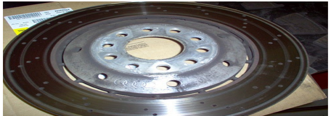
Figure 2. Grooved disc.

7. There is chemical contamination on the braking surface of the brake disc due to wheel or tire cleaner being sprayed directly onto the brake disc (Figure 3 and Figure 4).