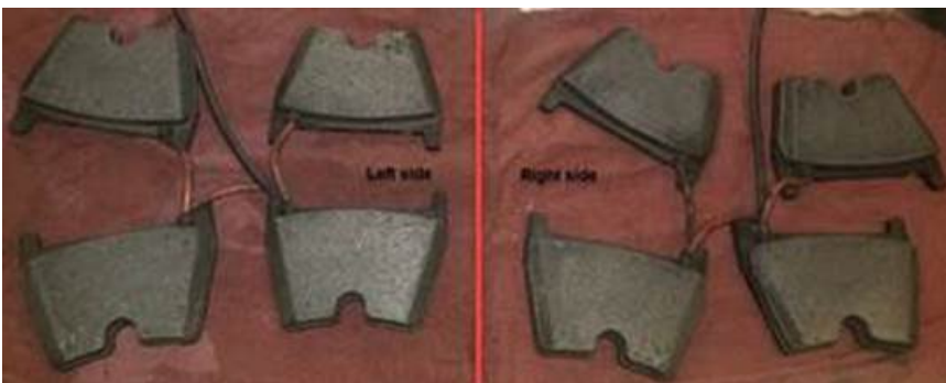
Figure 11. Example of pads without adhesive (mark position for reinstallation if not replaced).