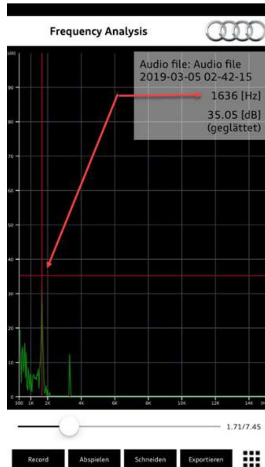
Figure 6. Example of a frequency analysis screenshot.