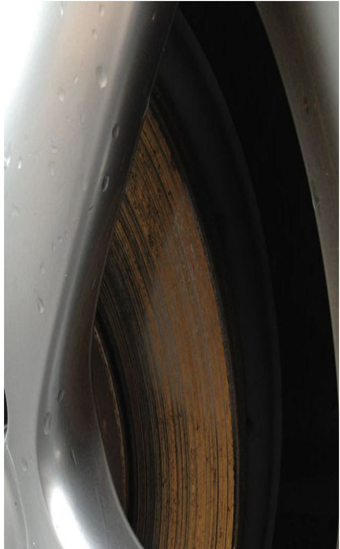
Figure 1. Disc covered with rust.