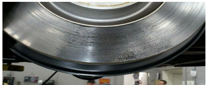
Figure 5. Brake pad material has transferred to the discs.