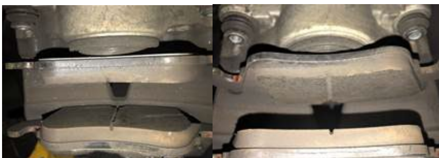
Figure 9 and 10. Example of Inner and outer with an adhesive pad.