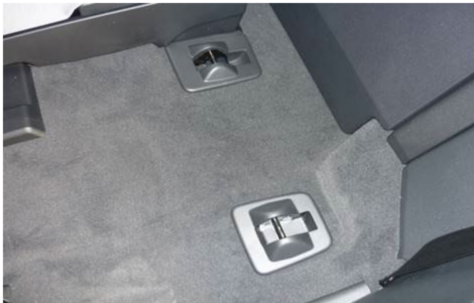
Figure 3. Outer and inner locking plate with trim installed.