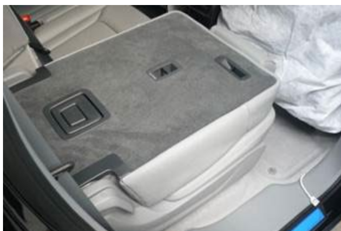
Figure 1. Affected second-row seat.