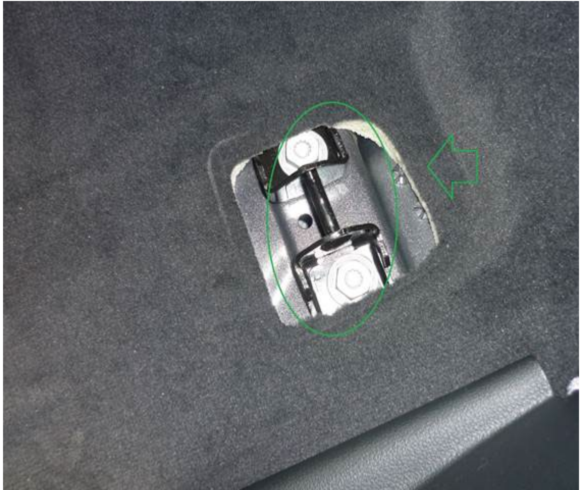
Figure 5. Outer locking plate with trim removed.

Mark the location of the locking plate prior to loosening the bolts.