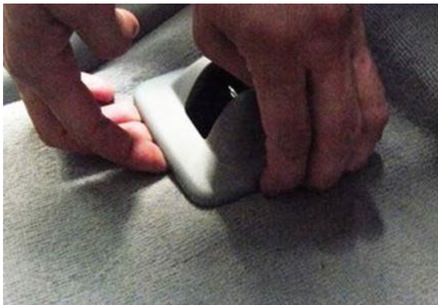
Figure 4. Outer locking plate trim removal.