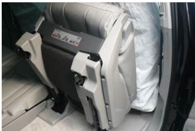
Figure 2. Affected seat unlatched and tilted forward.