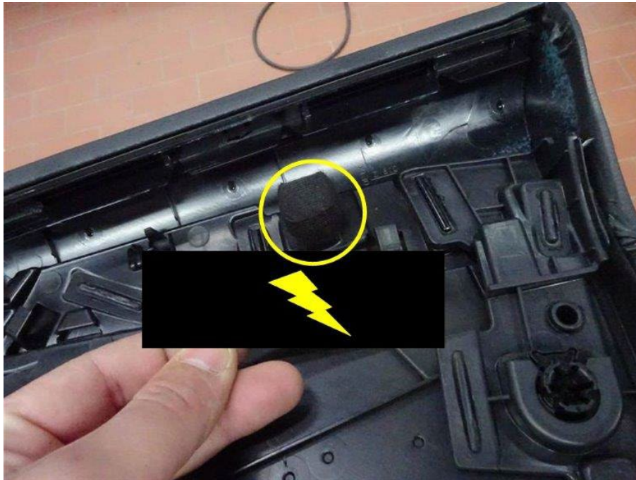
Figure 2. Incorrect application of fleece tape on crash element. Do not attach anything to the crash element or its retaining clamp!