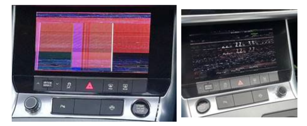
Figure 1: Display distorted

• The lower display flickers intermittently or the display seems to be distorted.