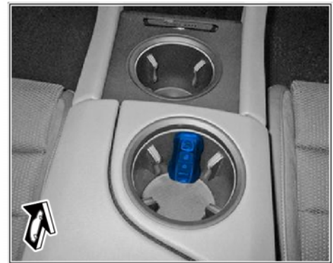
Emergency start tray