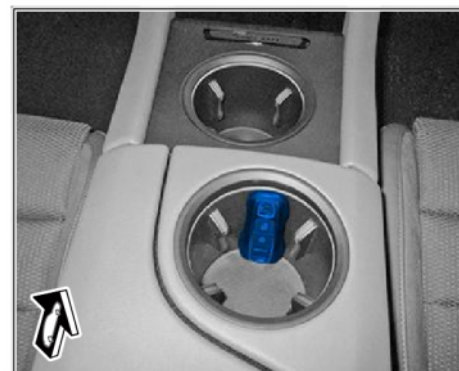
Emergency start tray