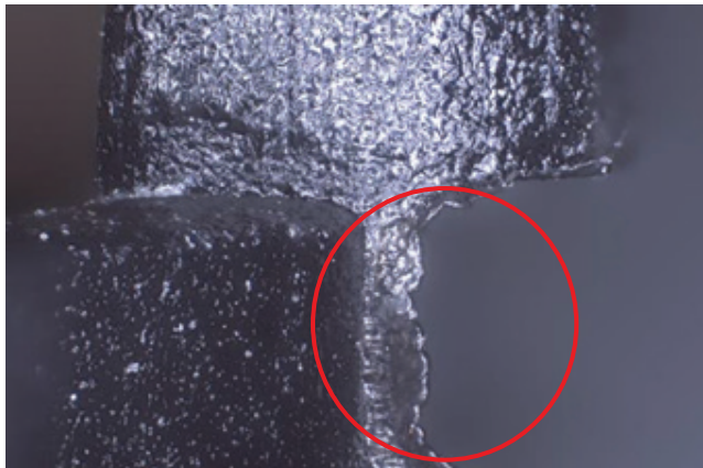
Figure 1 - Sharp Edges on Upper Oil Pan

The aforementioned condition may be caused by an injection molding byproduct known as flashing which may be responsible for sharp edges in the upper oil pan housing as seen in Figure 1 .