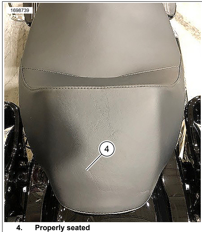
4. Properly seated

4. See Figure 4. The same bike seat is shown after the foam padding has been properly seated (4). There is no visible sunken area.