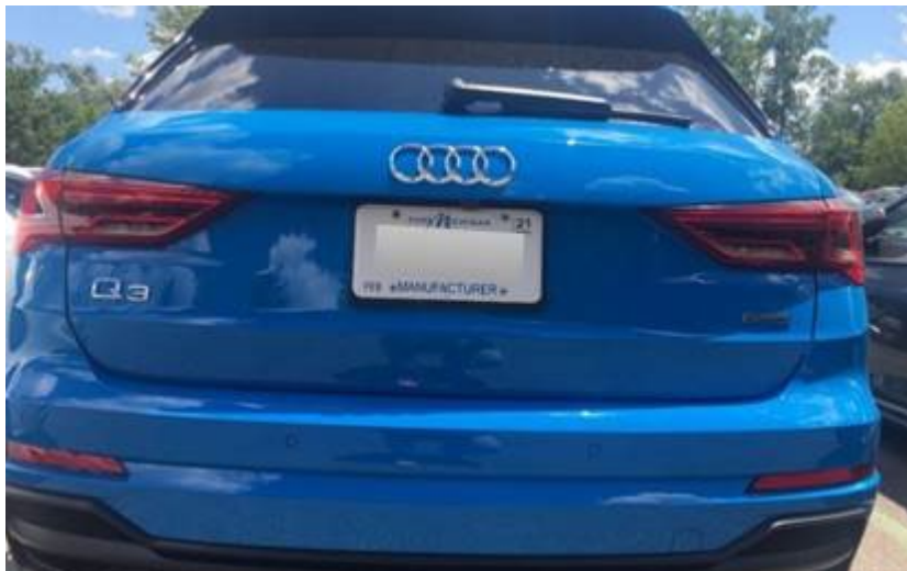
Figure 2. The rear license plate successfully installed on the new Q3.