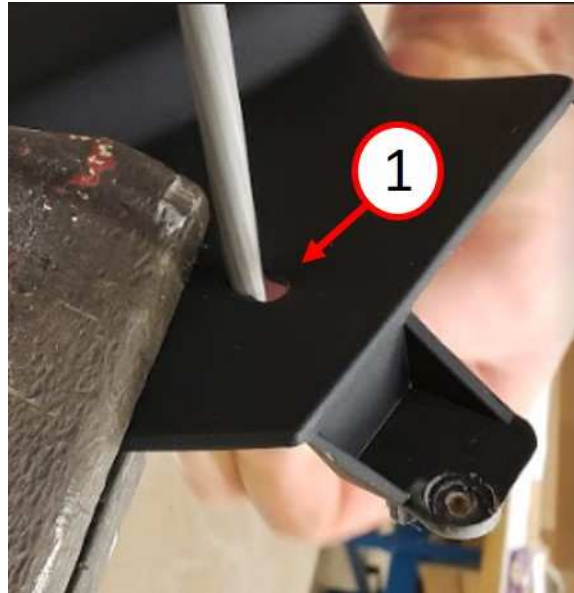
Fig. 1 Back Side Shield Hole Being Elongated

1 - Use a hand held rotary multi use tool or a file to Elongate Hole.