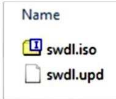
Fig. 1 Two USB Files

NOTE: Two files will be loaded onto the USB flash drive (Fig. 1) .