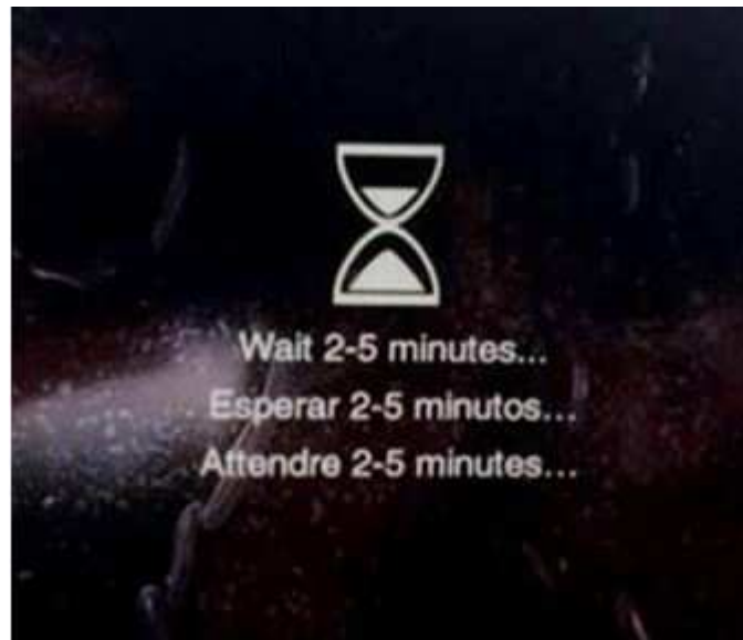
Fig. 3 Hourglass Screen

NOTE: During the update process you will see multiple hourglass and "Please Insert Update USB" screens for extended periods of time (several minutes) (Fig. 3) or (Fig. 4) . DO NOT remove the USB flash drive at this time. Only remove the USB flash drive when the update has completed, when the screen displays the software levels again. The screen will say "Software updated successfully".