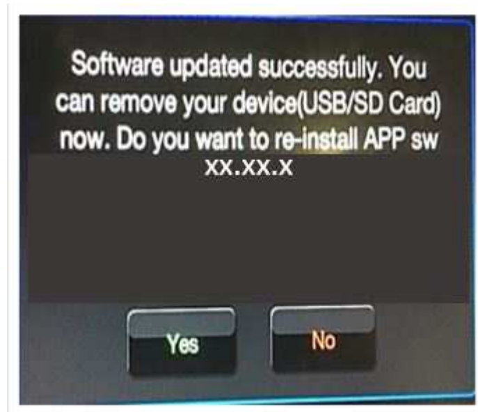
Fig. 5 Software Updated Successfully