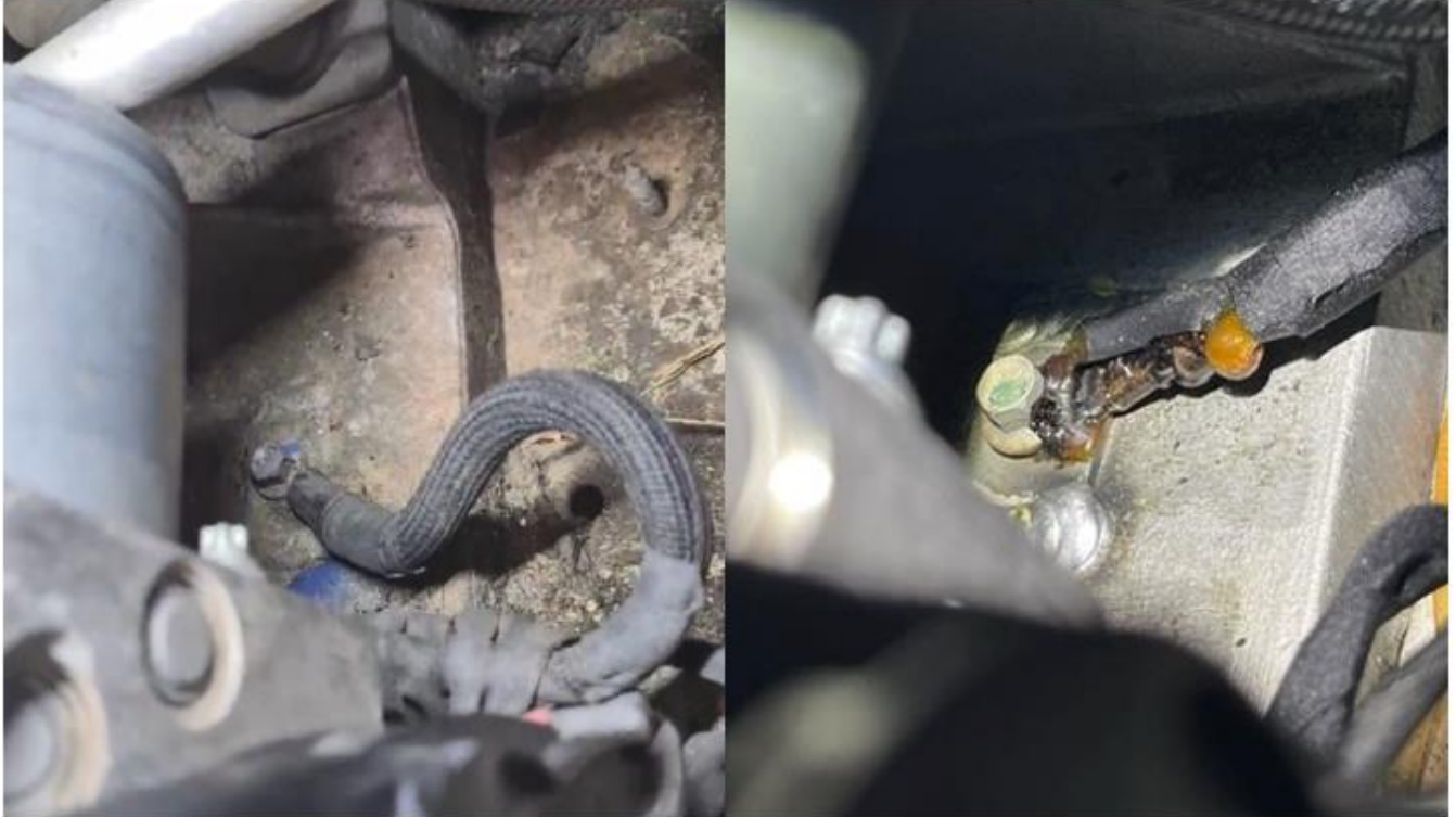
Figure 1.2 – Examples of poor grounding for Steering Pump

If damage to the harness is found, please proceed to submit a Technical Request.