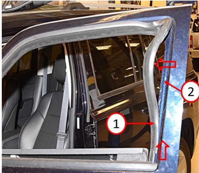
Fig. 1 Weatherstrip Removal