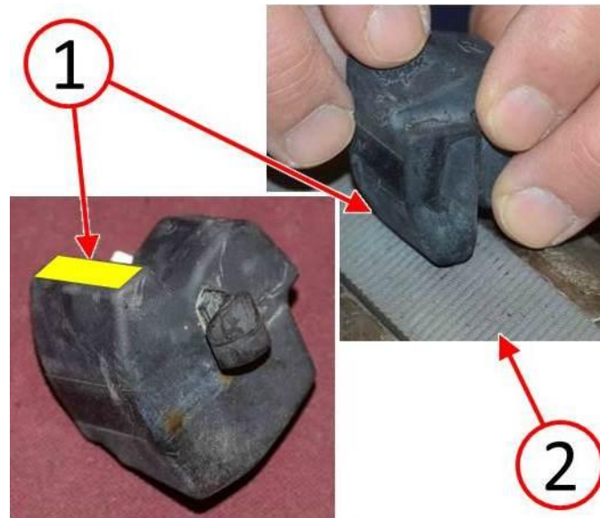
Fig. 2 Modify Bumper