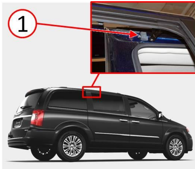
Fig. 1 Remove Bumper