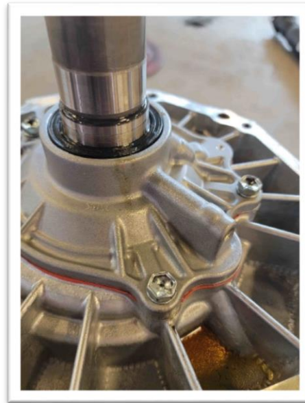
Figure 2 Input Shaft Seal Leak