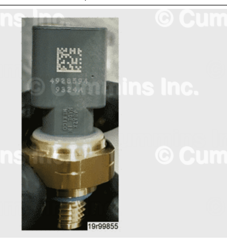
Figure 1, Genuine Cummins® Exhaust Gas Pressure Sensor.