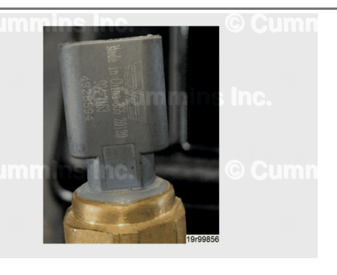
Figure 2, Aftermarket Exhaust Gas Pressure Sensor.