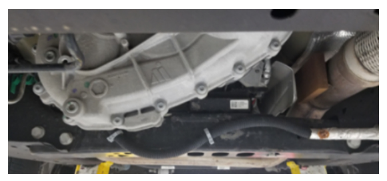
Note: Only replace the plug that is leaking.