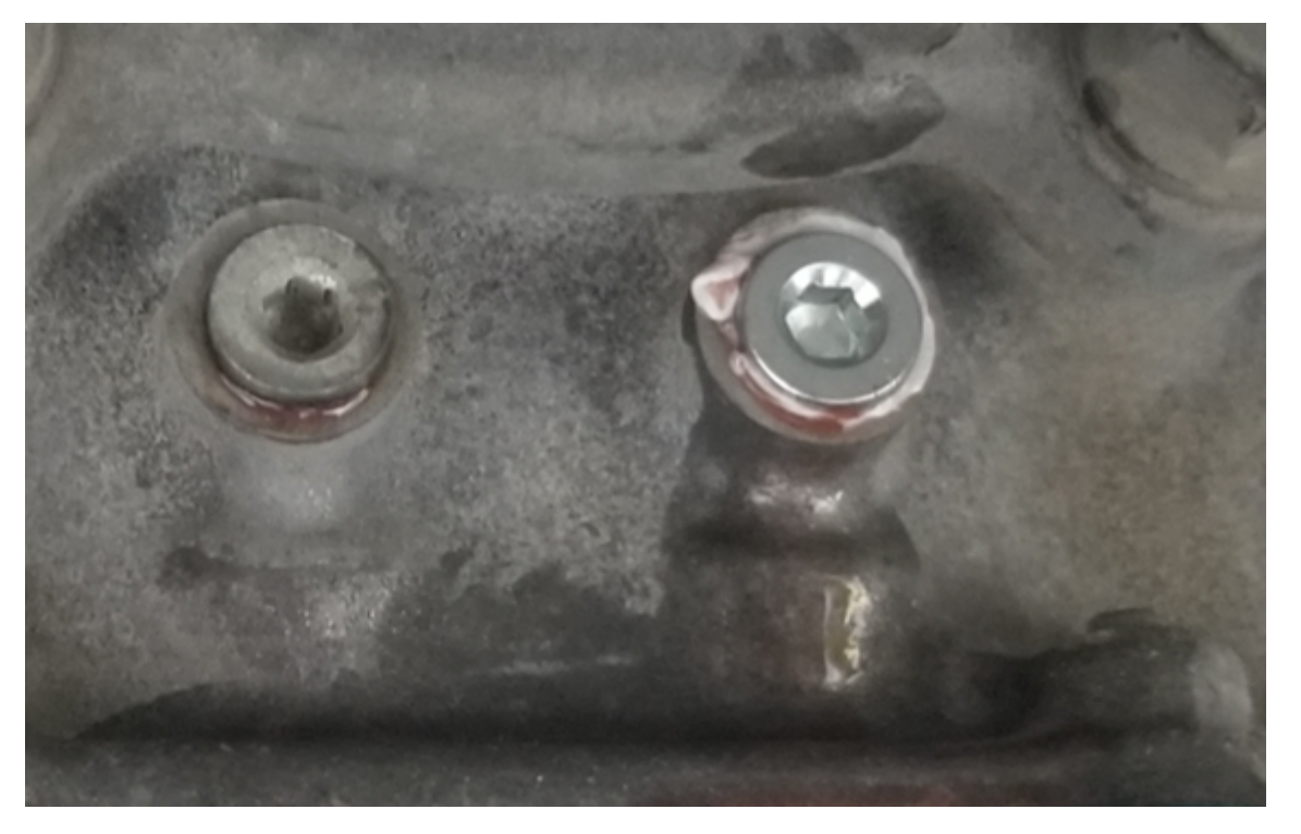
Reinstall the transmission cross member following SI

Check the transmission fluid level following SI and correct as needed. Transmission Fluid ULV 19352619 (Can 19352620)