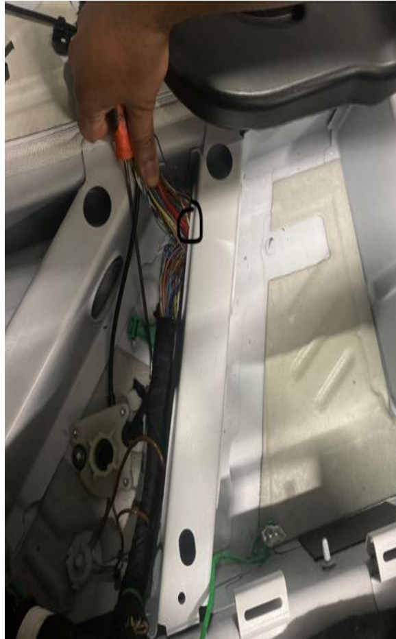
Figure 1. A perspective view showing the area along the frame rail.

Using the description in the example above, the root cause can be clearly identified in Figure 1.