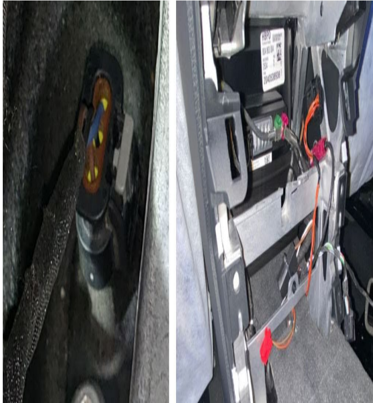
Figure 2. G28 crank sensor harness tight (left), Q5 Wireless charging pad harness tight (right).

When a harness routing is determined to be the root cause, a photo should be taken to show how the harness was routed in its normal state (Figure 2).