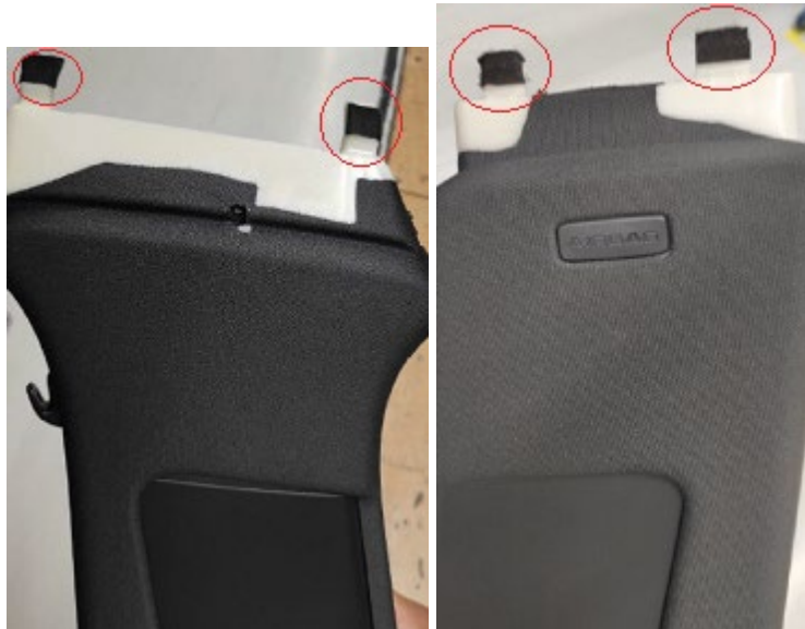
Figure 1-2. D004350A2 tape applied to the upper mounting points of the Q7/Q8 upper B-Pillar trim