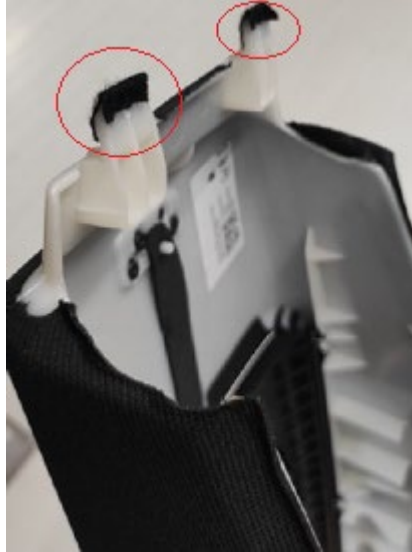
Figure 3. Webbing adhesive tape folded over on mounting points

For better adhesion to the trim mounting points, cut the webbing adhesive tape long enough to fold the tape over (Figure 3).