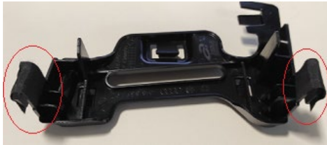
Figure 4. D373125A2 tape applied to the lower mounting points of the Q7/Q8 upper B-Pillar trim.