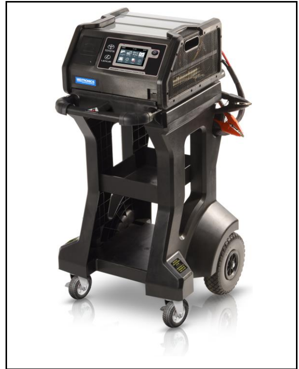
Figure 1. DCA-8000 Battery Diagnostic Tool