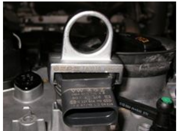
Figure 4. Special tool T40039 .

Note: Always use special tool T40039 to remove ignition coils (Figure 4).