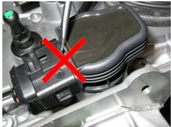
Figure 2. Incorrect method of disconnecting the ignition coil.