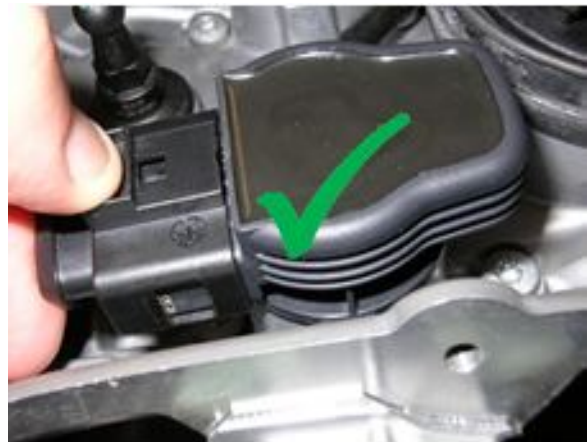
Figure 1. Correct method of disconnecting the ignition coil.