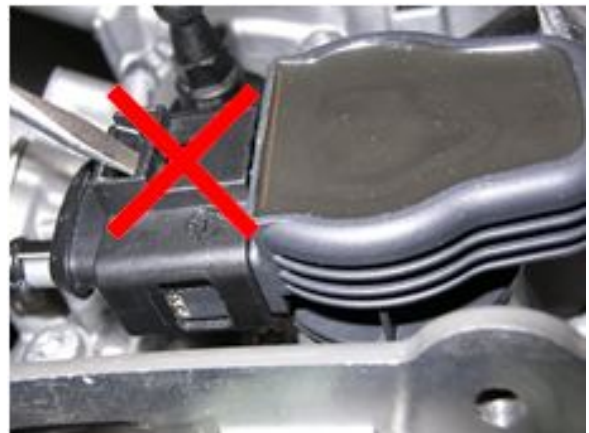
Figure 3. Incorrect method of disconnecting the ignition coil.

3. Check the part number of the coils (Figure 3). If one of the following part numbers is installed, all four ignition coils will need to be replaced: