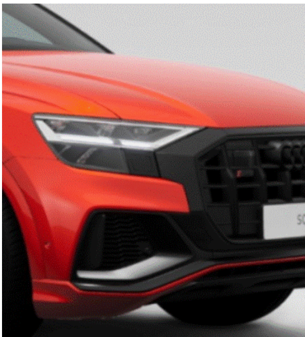
Figure 2. Correctly configured radiator grille trim in LY9B Brilliant Black.

Figure 2 shows the correct configuration with a LY9B Brilliant Black radiator trim.