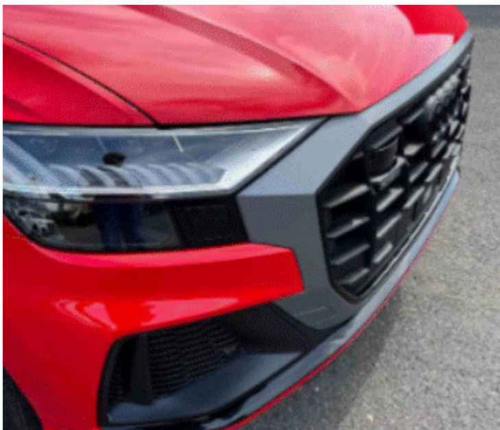
Figure 1. L1RR Platinum Grey radiator grille trim installed. LY9B Brilliant Black trim intended.

The trim that surrounds the front radiator grille installed in production is L1RR Platinum Grey instead of the intended LY9B Brilliant Black trim.