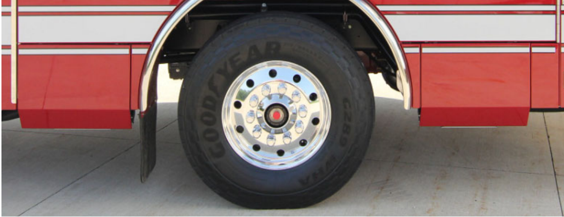
Option 3 Automatic air steps retracted

If any additional support is needed, please open a technical support incident on Pierceparts.com .