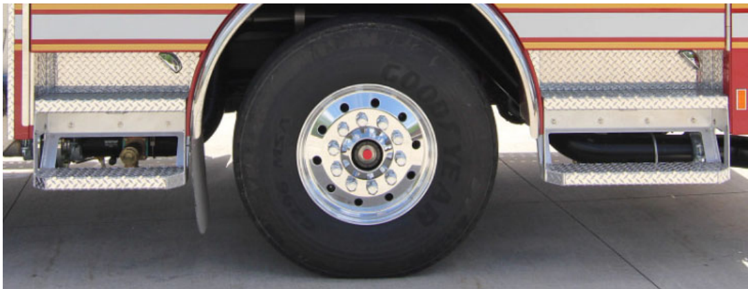
Option 2 Dual fixed steps

NOTE: If job is a two or three door cab, please submit an NPN request on Pierceparts.com