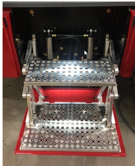
Option 3 Automatic air step extended