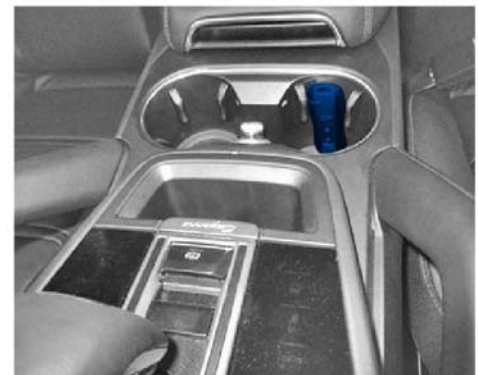
Emergency start tray

The vehicle type is then read out, the diagnostic application is started and the control unit selection screen is populated.