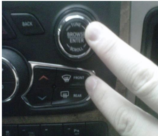
Fig. 2 Take Vehicle Out of Ship Mode