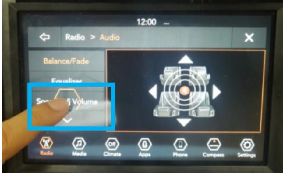
Fig 2 Select Speed Adjust Volume.