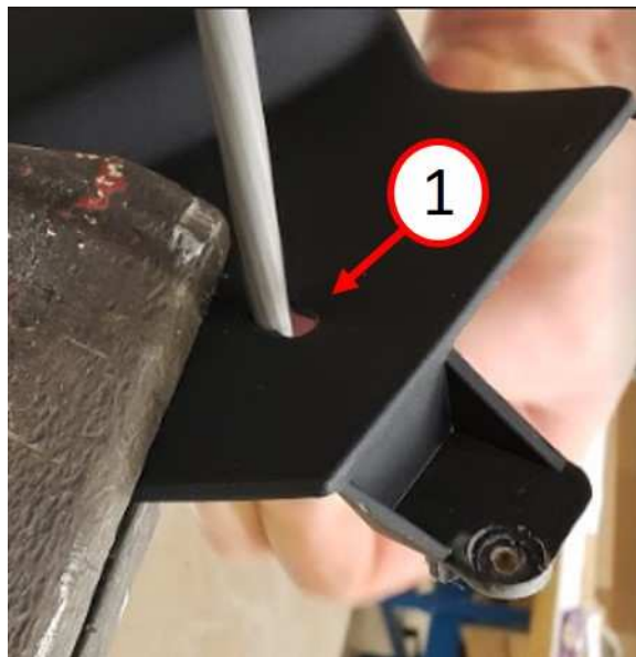
Fig. 1 Back Side Shield Hole Being Elongated