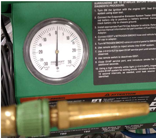
EEST hose adaptor