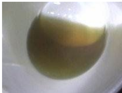
Figure 2. Fluid photograph example showing approximately one inch of fluid in the white cup, and tilted on an angle to show depth and color.