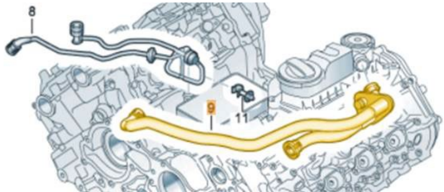
Figure 1. Breather line for the Turbocharged V6.

Replace the breather line (different variants available, only order by VIN) by following the Elsa repair manual (Figures 1 and 2).