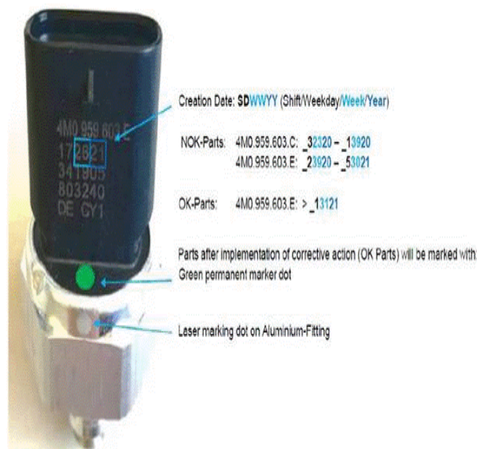
Figure 1. Pressure and temperature sensor markings and build date.