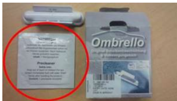
Figure 2. Cleaning cloth from the D 096 330 A2 window seal set.

This residue can be removed using the cleaning cloth (Figure 2) from the window seal set D 096 330 A2. Apply moderate pressure while cleaning.