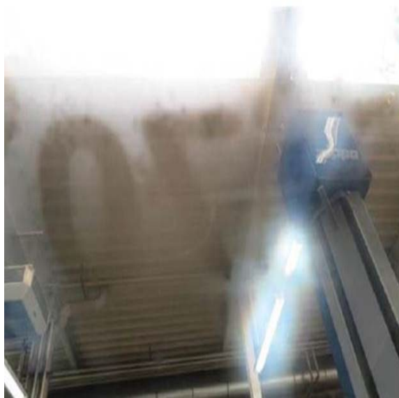
Figure 1. Faint images on the window.

Residue from suction cups or labels can transfer to the glass and, while not visible under normal conditions, can be seen under certain lighting or moisture conditions (Figure 1).