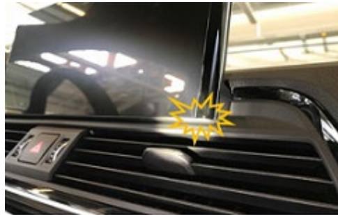
Figure 1. The gap between the MMI screen and the center vent should be 0.5 mm or greater.