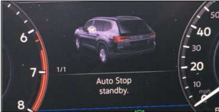
Figure 1: Message example