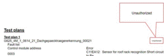
Figure 1. Test plan with 'unauthorized' tag

If the test plan is populated for this DTC it is tagged 'unauthorized' to indicate an over-read permission when this DTC is stored.