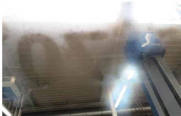
Figure 1. Faint images on the window.

Residue from suction cups or labels can transfer to the glass and, while not visible under normal conditions, can be seen under certain lighting or moisture conditions (Figure 1).