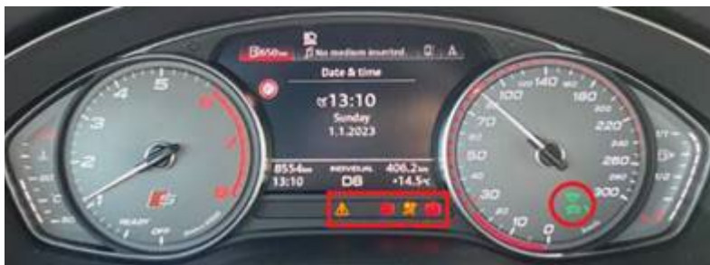
Figure 1: The warning lamps illuminated in the red rectangle are unintentional.

Various warning lamps may be illuminated (Figure 1); in this case, NO DTCs will be stored. Please replace the instrument cluster according to the instructions in the Elsa Repair Manual.