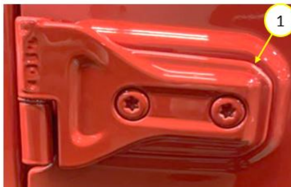
Fig. 3 New Style Hinge With Zinc Shim