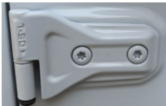
Fig. 2 Old Style Hinge

NOTE: There is only a slight difference between the old and new style hinges. There will be a small gap between the body and hinge ( Fig. 2 ) and ( Fig. 3 ) .