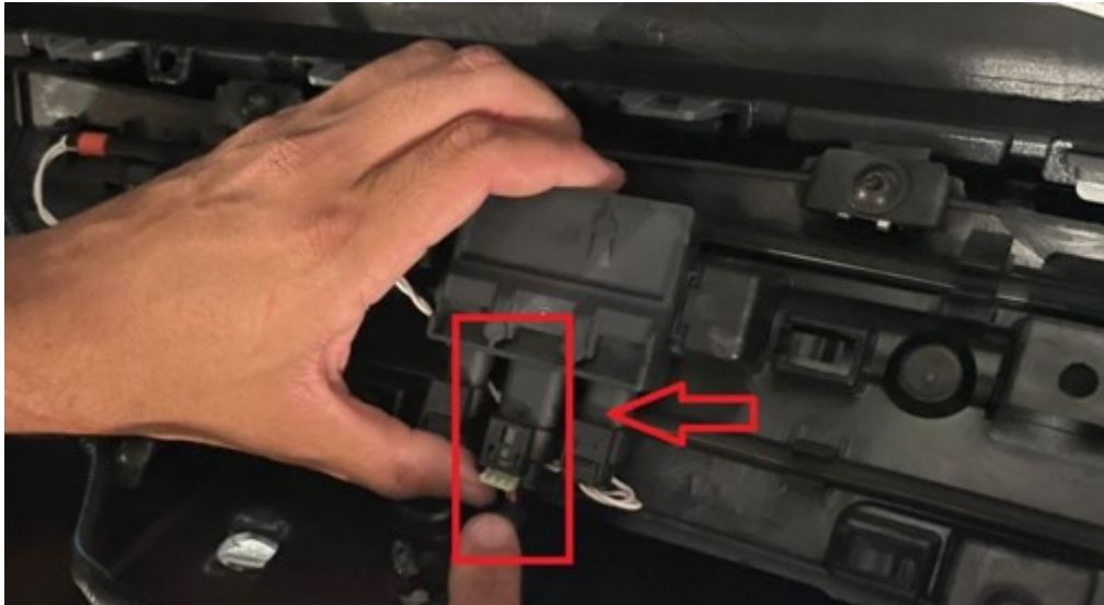
Fig. 4 Connector