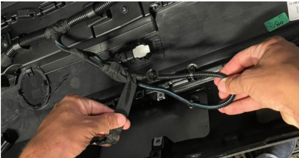
Fig. 1 Tape From Wiring