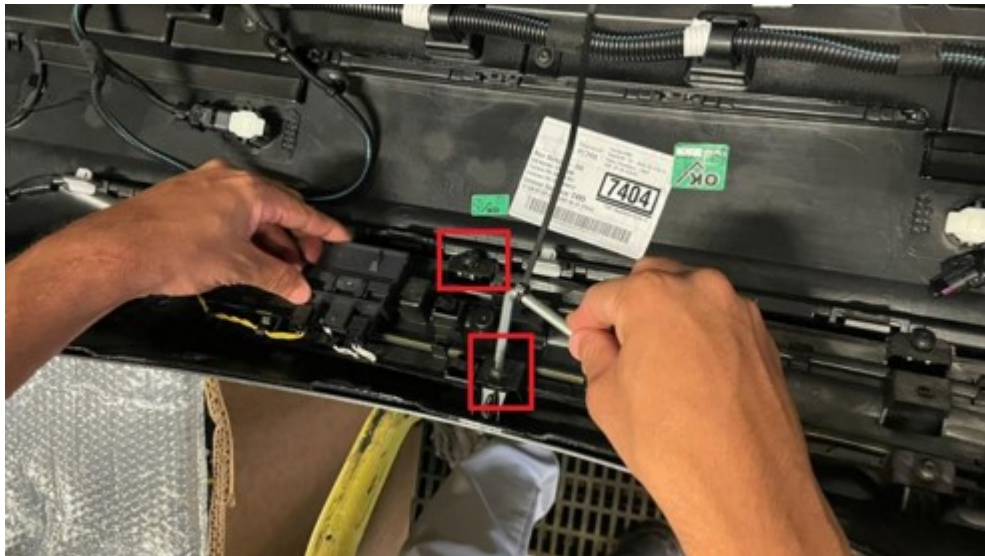
Fig. 3 Module Install

6. Install the new hands free module (Fig. 3) .