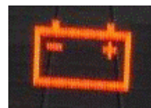
Figure 1. Red battery symbol.