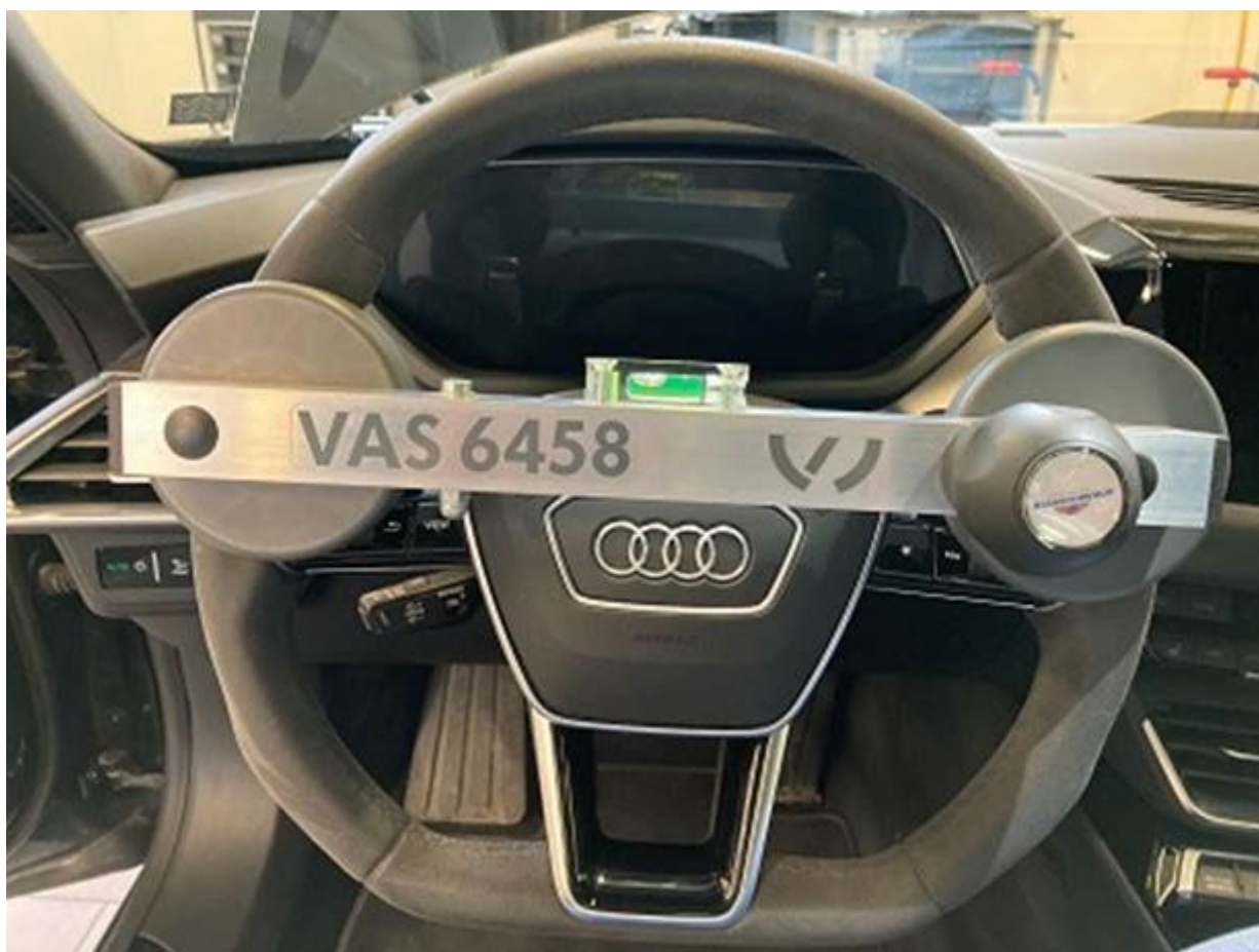
Figures 1 to 5: Examples of Steering wheel off center by 2° to the left and 2° to the right with VAS 6458 and VAS 6826 installed.