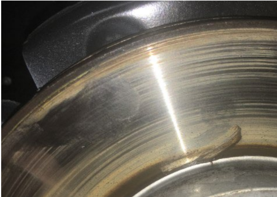
Figure 2: Example of a dirty friction surface on the brake disc.