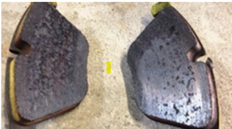
Figure 3: Example of brake pads with glazed friction surface.