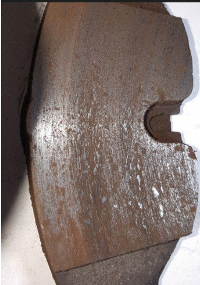
Figure 1: Example of a dirty friction surface on the brake pad.