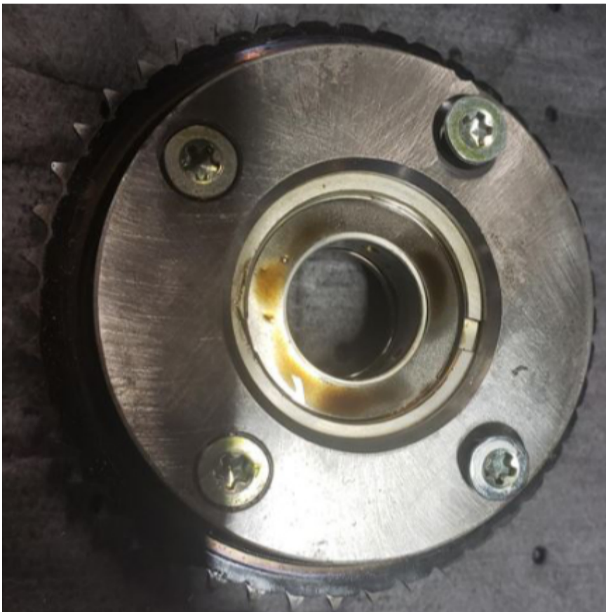
Picture below showing damage done to front face of Cam Carrier when the Intake Cam Actuator cover plate screws come loose and make contact.