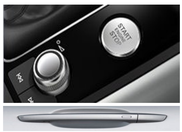
Figure 1. Start-stop button and door handle with touch sensor surface.

All vehicles have an engine start-stop button (-E408-) and touch sensor surface on the outer door handles (Figure 1), but this does not mean that the optional Audi advanced key function is installed.