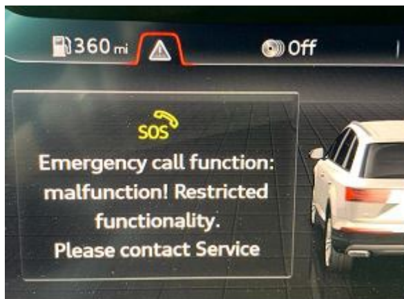
Figure 1: SOS Malfunction A4/A5/Q5

Emergency call function: malfunction! Restricted functionality. Please contact service.