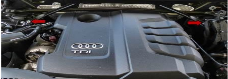
Figure 1. Example of tower brace for an Audi Q7.

2. If necessary, secure the bolt with the correct torque according to the repair manual and reassess the concern (Figure 1 and 2).