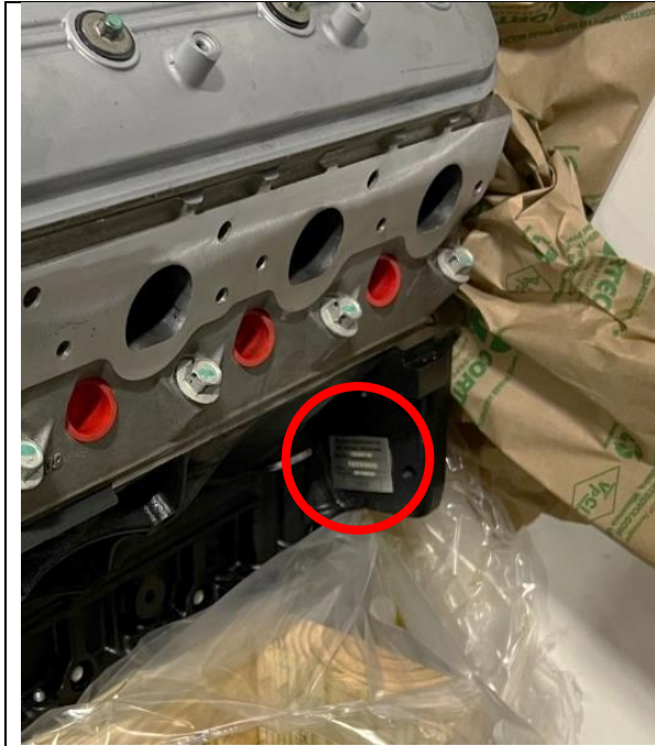
Figure 3. Gas Only

For all 6.0L (gasoline and KL8) engines the ESN must be programmed into the ECM.