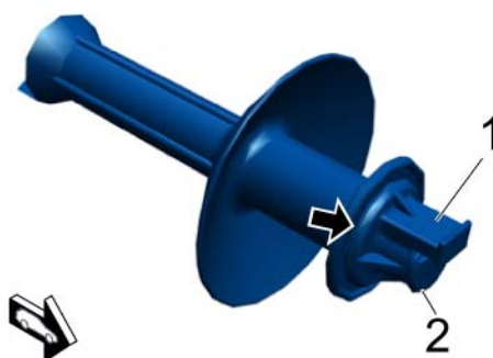
Drain hose seating