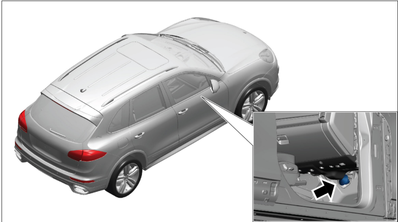
Installation position of drain hose on heating/fresh-air unit

Arrow – Drain hose on heating/fresh-air unit ( Replacing )