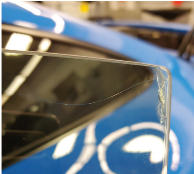
Figure 1 - Door glass: cracks in the top corner

There are two main causes for this condition: