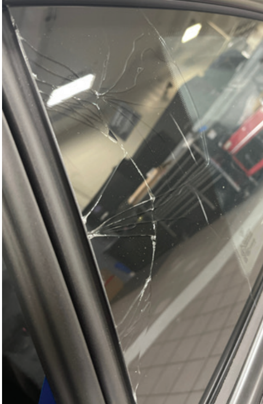
Figure 2 - Rear quarter glass (side window pane): cracks near front edge

There are two main causes for this condition: