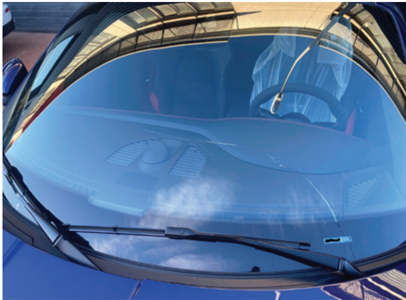
Figure 4 - Front windshield: various cracks

Stress cracks in the front windshield are currently being analyzed by Porsche. The root causes for the different kinds of stress cracks are unknown at the time of publication of this document.