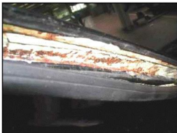
Figure 2 (Paint Group 01/02) – Door Repair