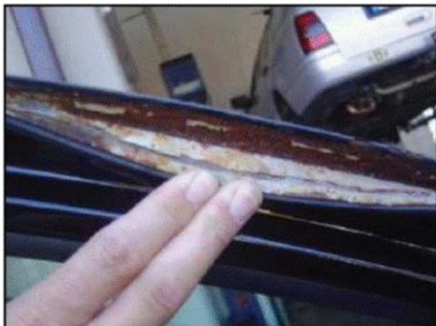
Figure 3 (Paint Group 03) – Door Replacement